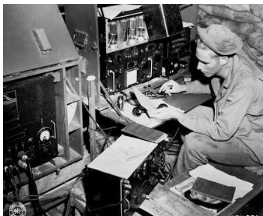
A US Army Signal Corps radio operator in 1943 in New Guinea transmitting by radiotelegraphy

The "trick chief" gets up from the teletype chair And says that he has one for me. "Get your key oiled up, get that rig on the air, Here's a honey - a long one O.P." My relief gets a curse on his unknowing head For his tardiness costs me my chow. And this is a hell of a time for a sked,